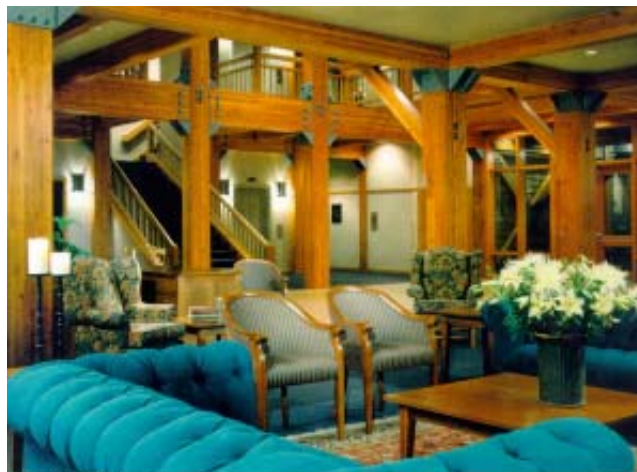
CAPE FOX LODGE Ketchikan, Alaska

SEATTLE GOLF CLUB CLUBHOUSE The Highlands Seattle, Washington