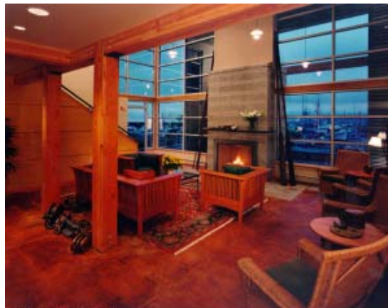
INN AT PORT GARDNER Everett, Washington