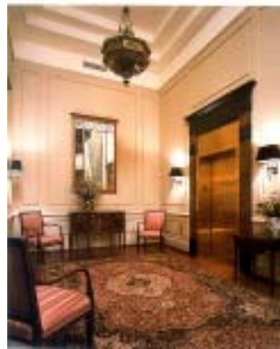
Waterfront Place Residential Lobby

ALEXIS HOTEL AND RESTAURANT Seattle, Washington