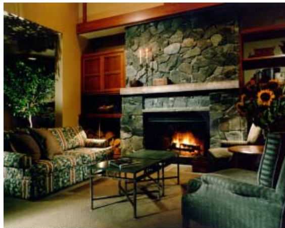
SEMAHMOO GOLF CLUB Blaine, Washington