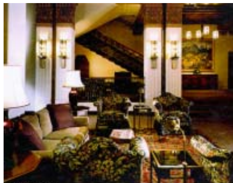
THE RAINIER CLUB Seattle, Washington

WOMEN'S UNIVERSITY CLUB Seattle, Washington